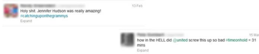
Figure 5. CEO tweet “expletive” exemplars

The letter included a link to the survey and was sent by the publication to all of the magazine subscribers for whom e-mail addresses were on file (14,261 individuals), of whom 487 responded (3.41 percent). This sample size is about double that of many public relations surveys with 100-250 respondents (e.g. Johansen et al. , 2012; Meng et al. , 2012; Tallapragada et al. , 2012; Shin et al. , 2011). It also represents a unique population of business executives to add to the voices of professionals who are most often surveyed for communication