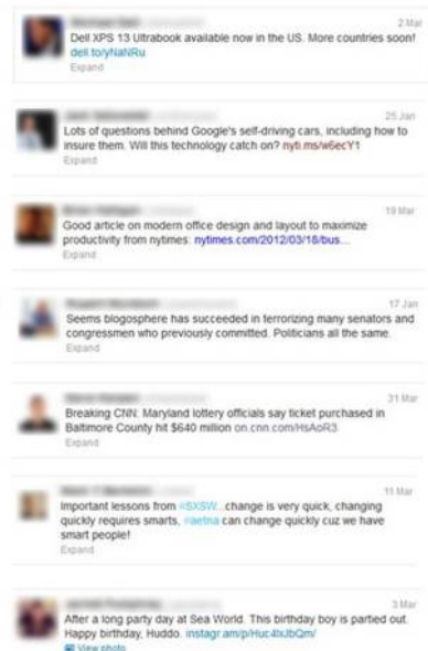
Figure 1. CEO tweet manual coding system

Personal: Tweet mentions events and/or includes photos from personal life, FourSquare check-ins, Pinterest posts and game results such as Words With Friends