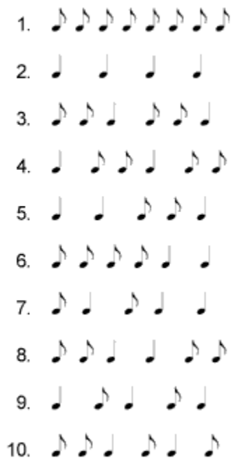
Figure 1. Pre/Posttest Rhythms

Once the ten rhythms were decided upon, a version of the pretest was created for each approach using corresponding rhythm icons. The Subdivision Approach used picture icons for each note, in this case, a big elephant for a quarter note, and a smaller elephant for each eighth note (see Figure 2). The use of picture icons for learning to read simple rhythms was introduced several decades ago in Mary Helen Richards' Threshold to Music (1964), and is still employed in some music series books. For example, The Music Connection (Grade 1, Silver-Burdett Ginn, 1995) uses big and little engines, big and little umbrellas, and big and little clouds to teach simple rhythm reading (pp. 69-70). Share the Music (Grade 1, McGraw-Hill, 1995) uses big and little shoes (p. 25). Students in the Subdivision Approach used the picture icon version of the pretest. These same icons were used in the instruction that followed.