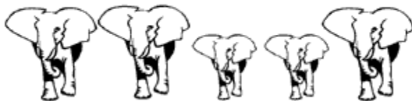
Figure 2. Pre/Posttest Phythm #5 in Picture Icons

The Additive Approach version of the pretest was written out using bar icons (see Figure 3). The length of the bar icons is proportional. The short sound is the basic unit, therefore the shortest