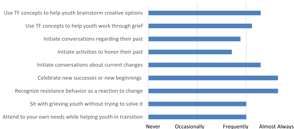
Fig. 1. Foster parent applications of Transitions Framework (TF) with youth.

were asked to rate them on a 5-point scale. Most items revealed that foster parents understood the framework. The responses demonstrated that foster parents saw value in the framework, with 100% strongly agreeing that it was important to help youth feel that the transition process is normal and strong agreement (mean = 4.9) about applying the concepts with youth in their homes. They also indicated that the three stages made sense to them (4.9).