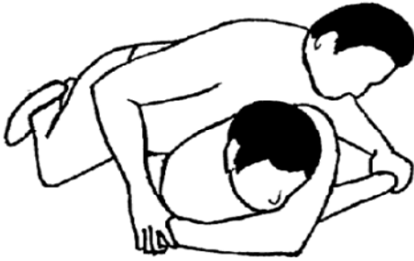
Figure 1.2 Basket Hold

Figure 1.2 Basket Hold: An adult holds a child from behind by the wrists with the child's arms crossed in front of the child; this can be done sitting, standing or lying down Adapted from Pust, T. (2012) "The Use of Prone Restraint in Minnesota Schools: August 2011 through January 2012," by Tammy Pust and Minnesota Department of Education, 2012. FY 2012 report to the legislature.